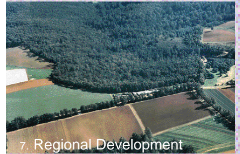
7. Regional Development