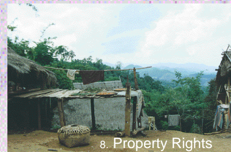
8. Property Rights