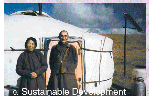
9. Sustainable Development