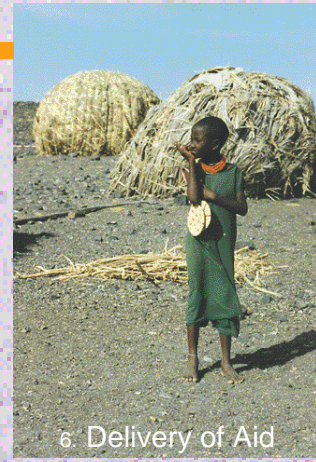
6. Delivery of Aid