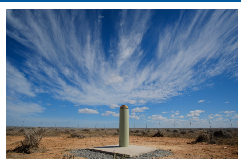
Figure 1. The new CORS basestation near Nullarbor, South Australia.

Within the RTCM 1006 Message Types, all CORS basestations will have GDA2020 coordinates, certified